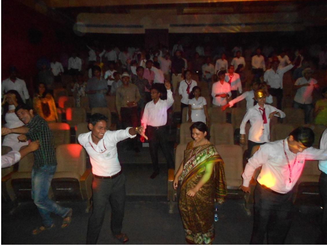
The entire student while performing task