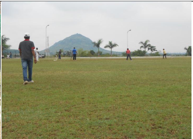
Students of MBA and MCA playing the match