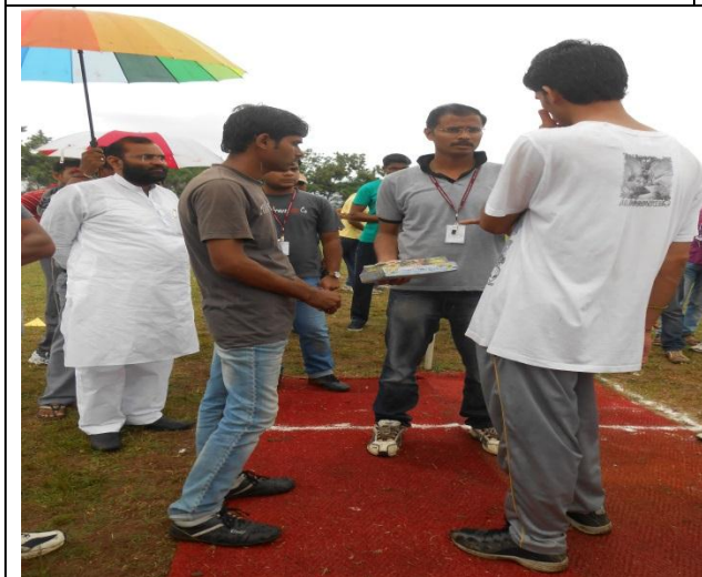
Instructions being given the participatory students